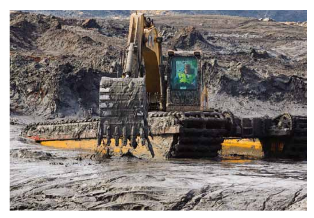
Coal ash sludge at Kingston Fossil Plant