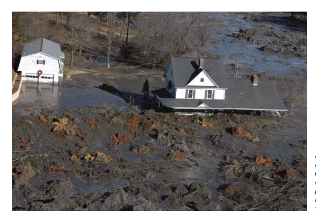
Home destroyed by the Kingston coal ash spill