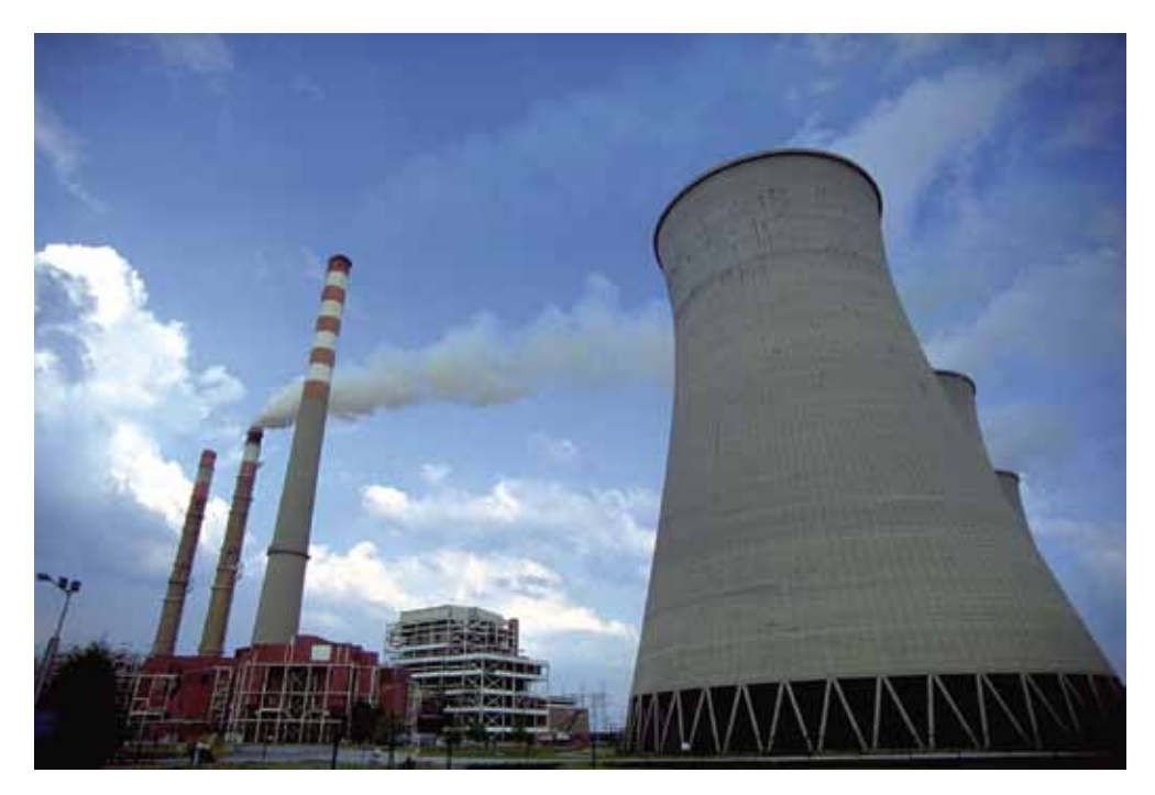
Paradise Fossil Plant