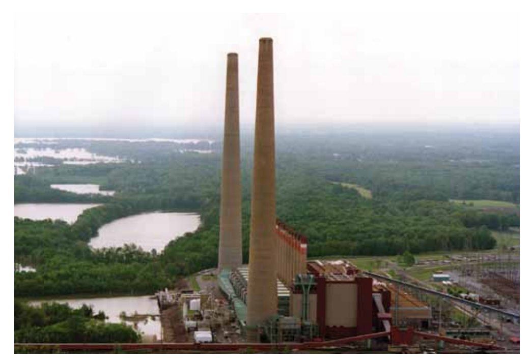
Shawnee Fossil Plant