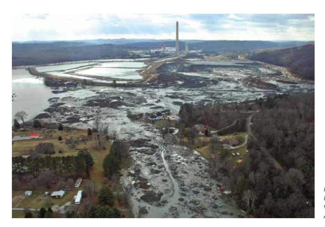
Kingston Fossil Plant—Aerial View of Coal Ash Spill