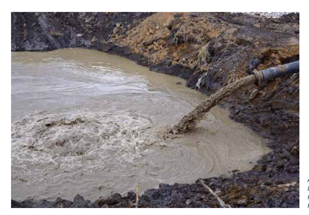
Ash and Water Discharge at Kingston Fossil Plant