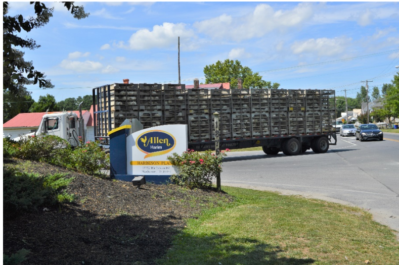
A truck loaded with live chickens drives through the entrance of the Allen Harim slaughterhouse in Harbeson, Del. The plant had more than 90 water pollution violations over four years, including dumping illegal amounts of ammonia and fecal bacteria into a local creek.

This report examines the history of the meat processing industry in the U.S., the sources and impacts of its water pollution, and recommended solutions. We use three local examples in different parts of the U.S. to illustrate different aspects of the industry that make water pollution from slaughterhouses a complex environmental challenge to tackle.