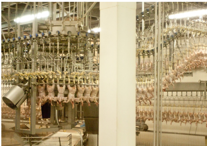
High-speed poultry slaughterhouse conveyor belts have vastly increased production—but can also injure workers.

Things started to change after World War II. With modern refrigeration and changes to how meat was packaged and sold, slaughterhouses no longer had to be close to