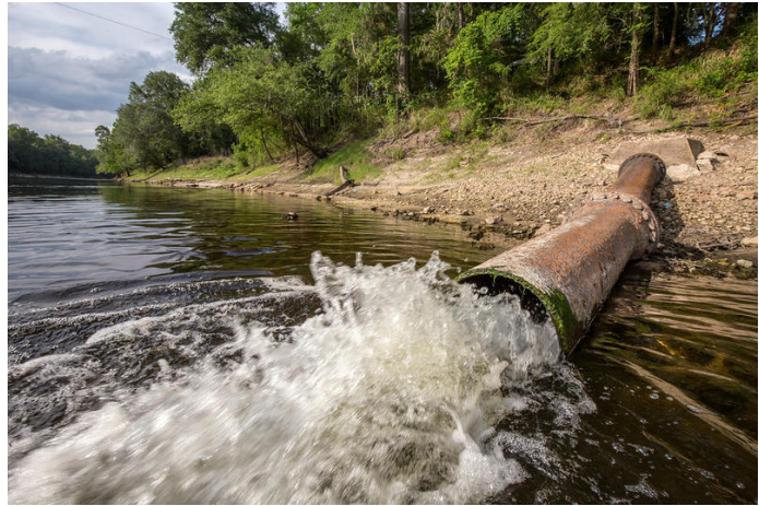
In Live Oak, Florida, wastewater pours from a Pilgrim's Pride meat processing plant into the Suwannee River

In this case, Environment America and the Sierra Club filed their lawsuit against Pilgrim's Pride Live Oak, a Florida-based chicken processing plant that already had a history of citations from environmental regulators for wastewater violations. The groups alleged that since 2012, the company had violated the Clean Water Act on 1,377 days, and that discharged wastewater had as much as tripled legal pollution limits.