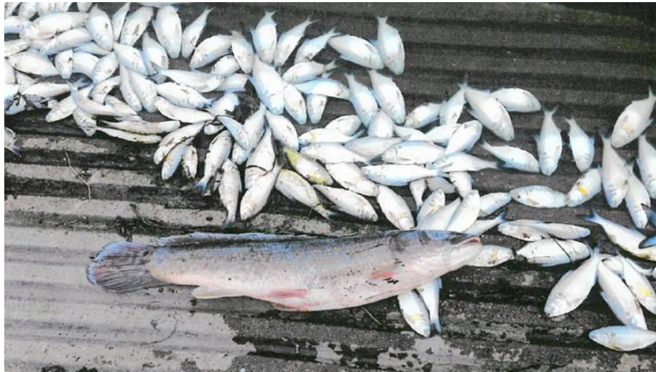
A spill of 29 million gallons of hog waste from a JBS meat processing plant in Beardstown, Illinois, killed 64,566 fish in tributaries to the Illinois River in 2015.

Beardstown is a small, rural community of only 6,000 people, and many of the 2,000 workers in the plant are immigrants, many from Mexico and about 30 other countries in Latin America, Africa and elsewhere. “Lower wages, along with increases in work speed and injuries – a trend in meatpacking plants across the Midwest in the late 1980s – made jobs less attractive for most white skilled workers,” according to a Reuters news report on the plant. 33 “Latino immigrants started coming to Beardstown, once an all-white town