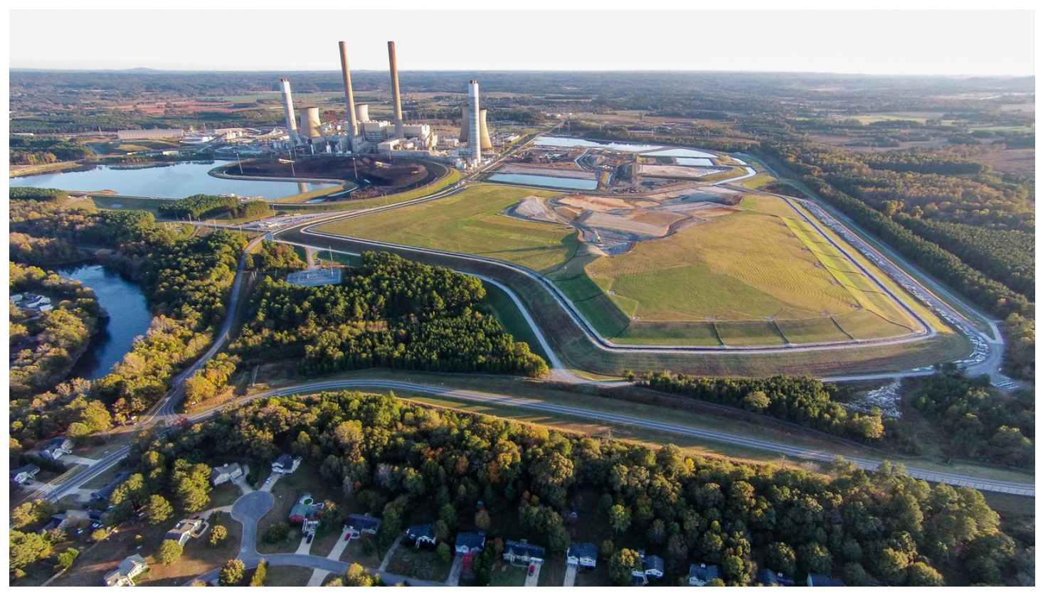
The groundwater at Plant Bowen is currently unsafe. Plant Bowen has had one catastrophic spill in 2002, when a four-acre sinkhole beneath its coal ash pond caused two million pounds of coal ash (260 pounds of arsenic) to enter a tributary of the Etowah River. (Waterkeeper Alliance)

Georgia Power's Plant Bowen is located 9 miles southwest of Cartersville, Georgia, near Euharlee. The plant started operation in 1975 and is the fourth largest coal-fired power plant in the US, capable of producing 3376 MW (megawatts) of electricity.