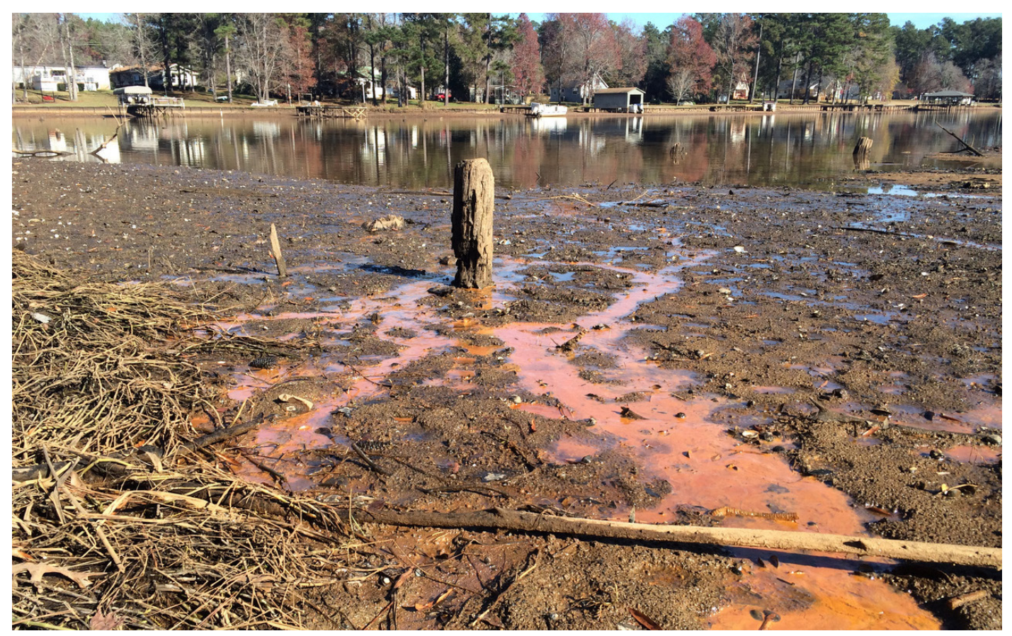
Contaminated groundwater seeping out of the banks and into Lake Sinclair, near Plant Harllee Branch, Dec. 9, 2015.

Georgia Power's Plant Branch is a retired coal plant located in Milledgeville on Lake Sinclair, southeast of Eatonton in Putnam County, Georgia. The 1539-MW plant operated from 1965 until 2015. There are four ash ponds at Plant Branch, and Georgia Power, until August 2018, planned to close these ponds by consolidating all of the ash in one unlined, high hazard pond known as Pond E, which it will then close in place.<sup>18</sup>