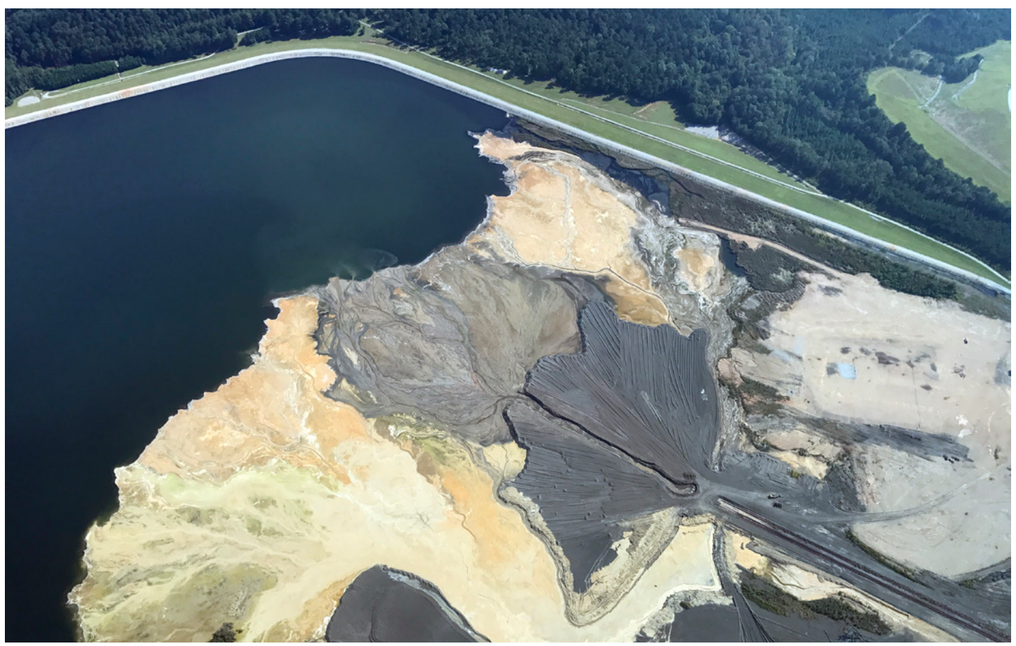
Plant Scherer. The widespread nature of the pollution threatens to harm the quality of life for all Georgians who value clean water and healthy rivers and lakes.

Georgia has an opportunity to protect its water resources by administering an effective state permit program. The goals of its program must be crystal clear — to protect both the health of Georgia residents and the quality of their water. The State must also pursue effective enforcement against facilities that fail to comply with coal ash regulations. Plants like Georgia Power's Plant Bowen, Hammond, McIntosh, Scherer, Wansley, and Yates must be investigated to ensure that their coal ash landfills are complying with monitoring and clean up requirements. The quality of Georgia regulations will determine the quality of its water. Lack of adequate rules and weak permits will result in continuing and worsening water contamination. The problems identified in this report need real solutions and firm resolve on the part of state leaders and citizens to demand an end to the pollution of Georgia water by leaking toxic coal ash dumps.