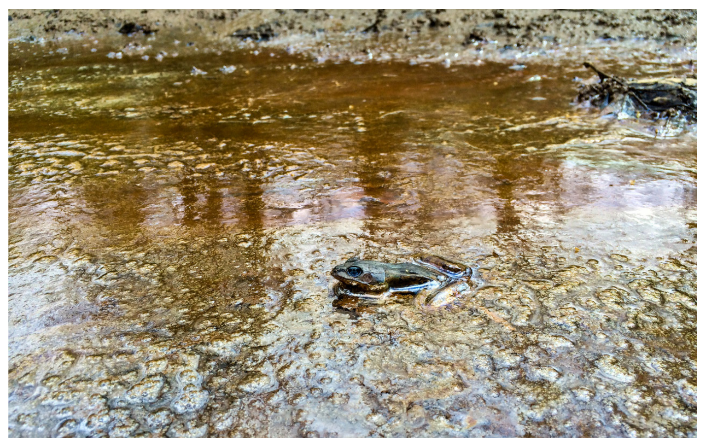
Contaminated water at Plant Hammond. The groundwater at Hammond is unsafe. Pollutants present at unsafe levels include arsenic, boron, cobalt, molybdenum and sulfate.

Georgia Power's Plant Hammond is a coal-fired power plant located on 1,100 acres in Floyd County, approximately 10 miles west of Rome. The plant began operating in 1954, and its four units can produce 843 MW of electricity.