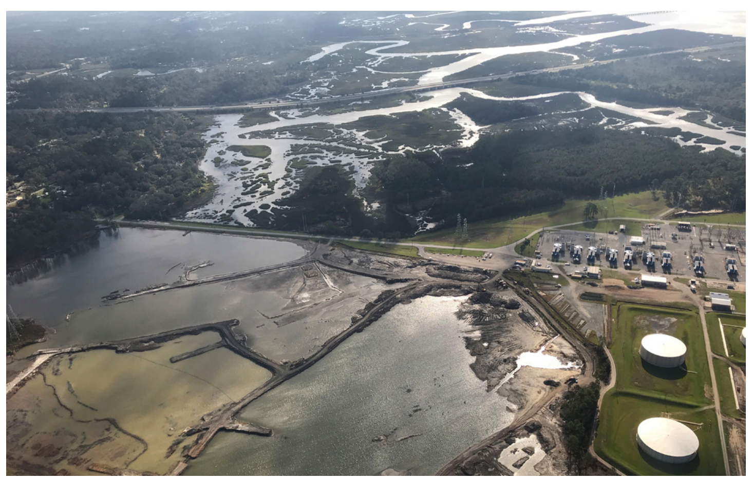
At Plant McManus, unknown amounts of coal ash spilled into Georgia's Golden Isles during Hurricane Irma in 2017.

Georgia Power's Plant McManus is located on 900 acres of land known as Crispen Island on the Turtle River near Brunswick. The coal plant started operation in the 1950s, but its two coal boilers (122 MW) ceased burning coal in 1971. Plant McManus currently operates nine oil-fired combustion turbines.